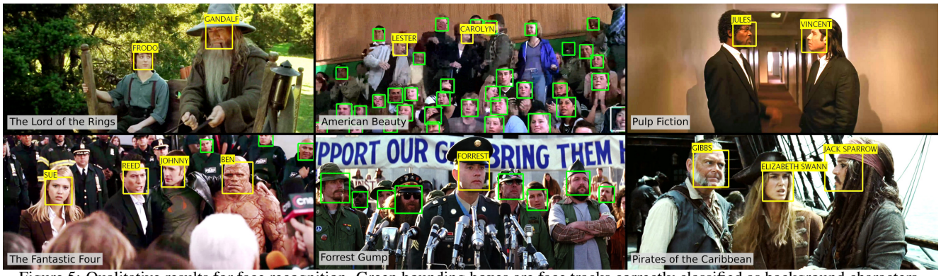
Figure 5: Qualitative results for face recognition. Green bounding boxes are face tracks correctly classified as background characters.