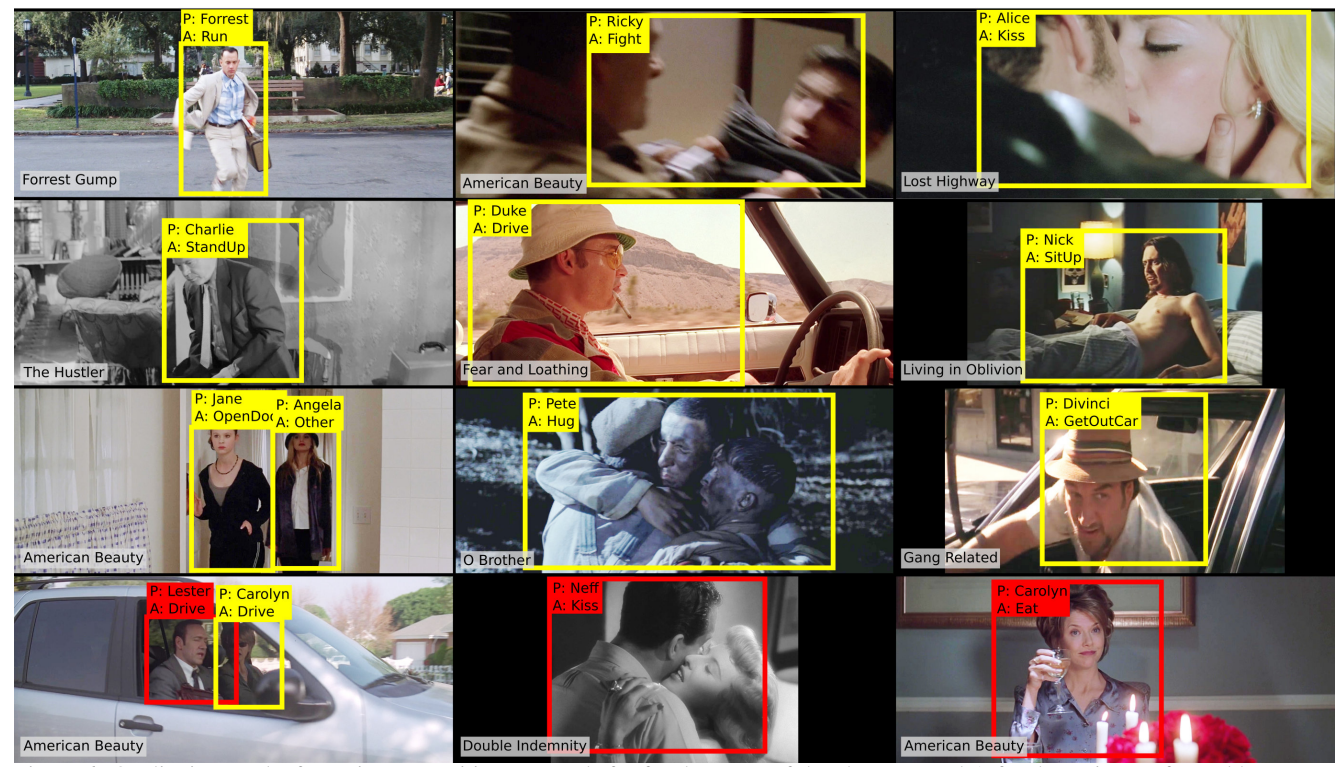
Figure 6: Qualitative results for action recognition. P stands for for the name of the character and A for the action performed by P. Last row (in red) shows mislabeled tracks with high confidence ( e.g. hugging labeled as kissing, sitting in a car labeled as driving).