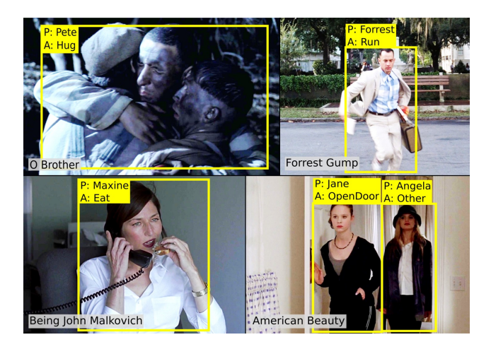
Figure 1: We automatically recognize actors and their actions in a of dataset of 66 movies with scripts as weak supervision.

weakly annotated video data has not been fully explored.