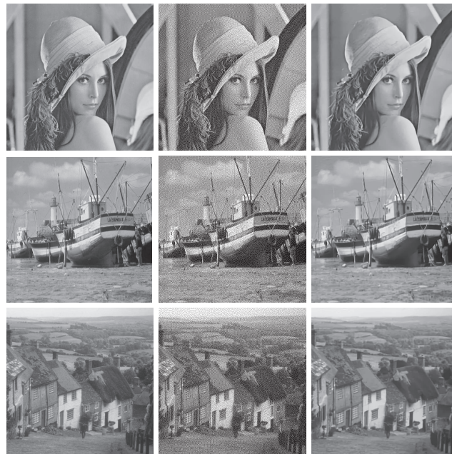
Fig. 2. From left to right: Original images, halftoned images, reconstructed images. Even though the halftoned images (center column) perceptually look relatively close to the original images (left column), they are binary. Reconstructed images (right column) are obtained by restoring the halftoned binary images. Best viewed by zooming on a computer screen.

Unlike most image processing approaches that explicitly model the halftoning process, we formulate it as a regression problem, without exploiting any prior on the task . We use a database of 36 images; 24 are high-quality images from the Kodak PhotoCD data set 10 and are used for training, and 12 are classical images often used for evaluating image processing algorithms; 11 the first four